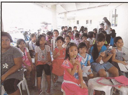
The Junior girls' Sunday school class