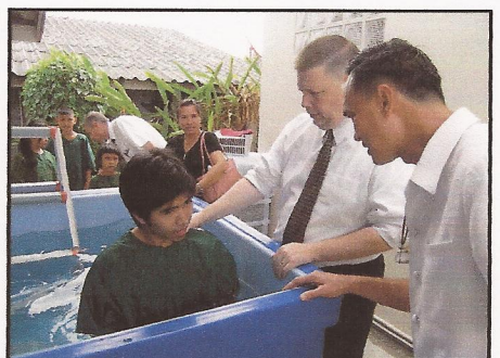
Preparing to baptize our 1,200th convert