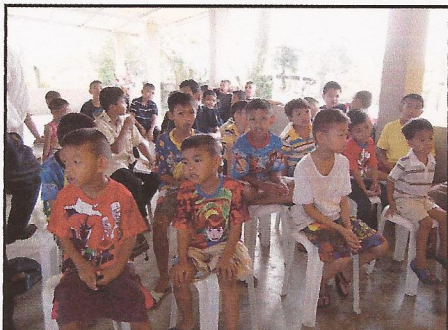
The Junior boys' Sunday school class

We have now baptized over 1,200 of our converts. So far this year we have averaged 219 in our Sunday morning services. We are averaging 73 salvations and 10 baptisms per week. We also have four more families on deputation to join us in the coming year. Please pray for Thailand and please pray for our team as we work hard to be faithful in the work that our Lord has called us to do.